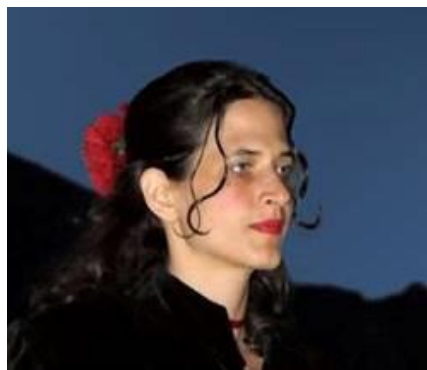
ZSOFIA GULYAS (Hungary) Actress