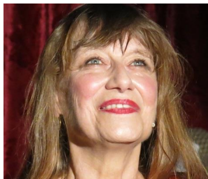
DANIELA REGNOLI (Italy) Actress